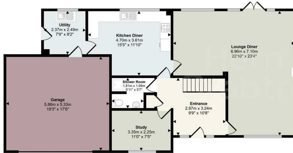
Ground Floor Approx 119 sq m / 1283 sq ft

Approx Gross Internal Area 194 sq m / 2083 sq ft